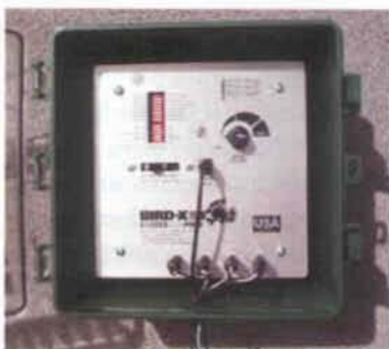
Left: The units feature an adjustable volume control.

Then I put the other two speakers on the upper roof," he explains. That gave complete coverage and the desired prevention.